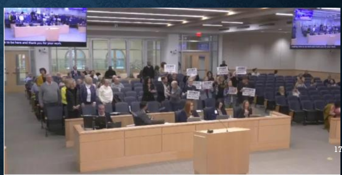
Advocates for a dedicated fund for arts and culture and Virginia Beach stand up during a council meeting on March 19, 2024